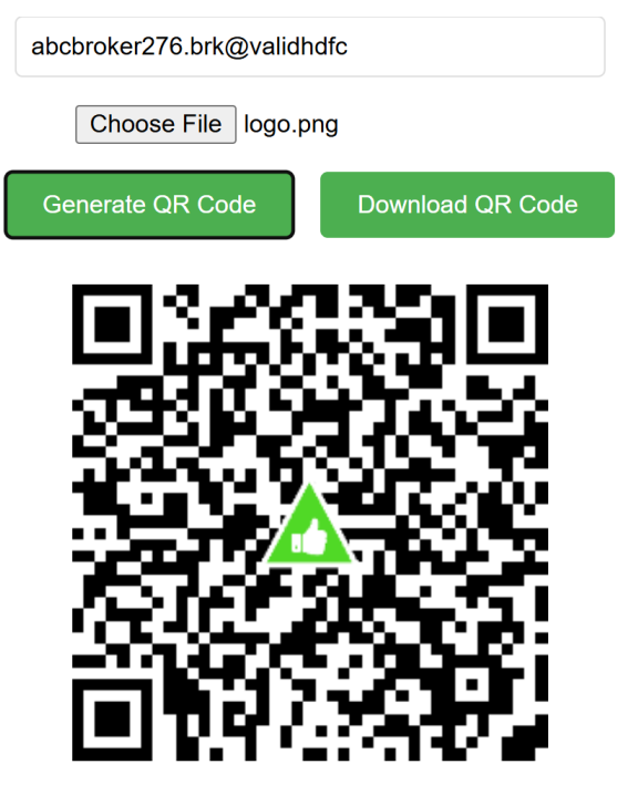
UPI ID: abcbroker276.brk@validhdfc

An indicative QR code has been placed below: