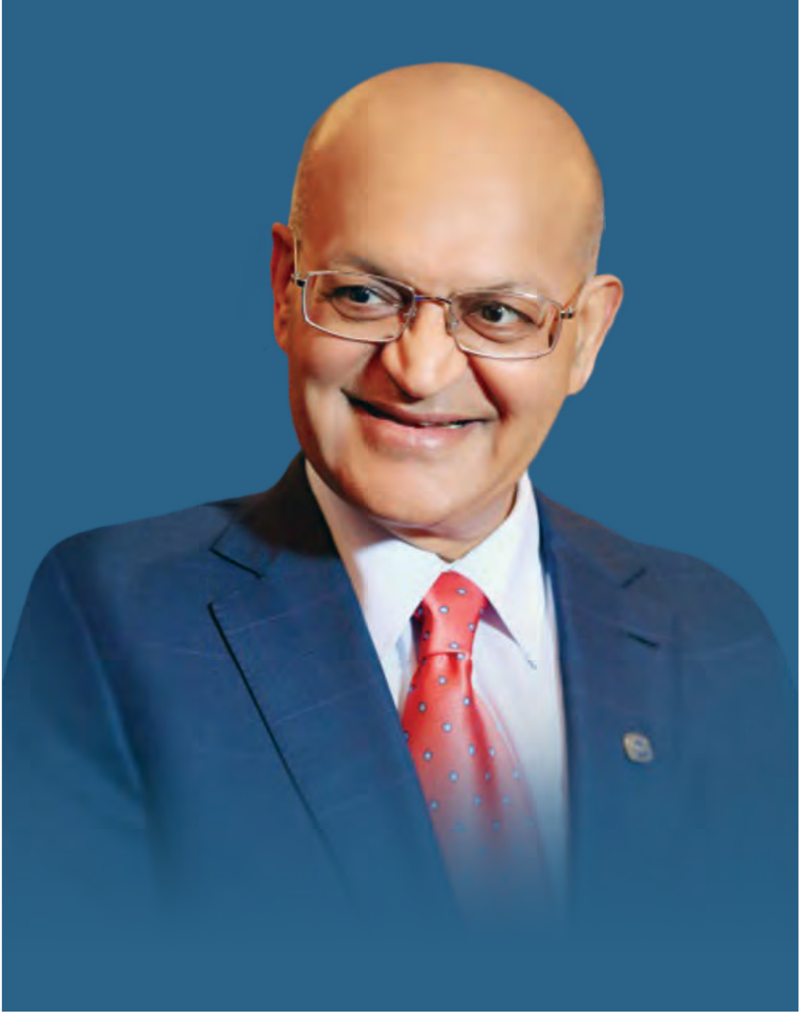
Hon'ble Shri Abhey Kumar Oswal